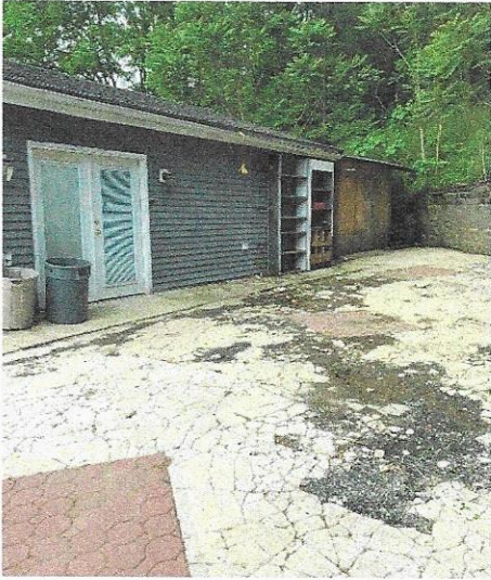
Rear of Garage