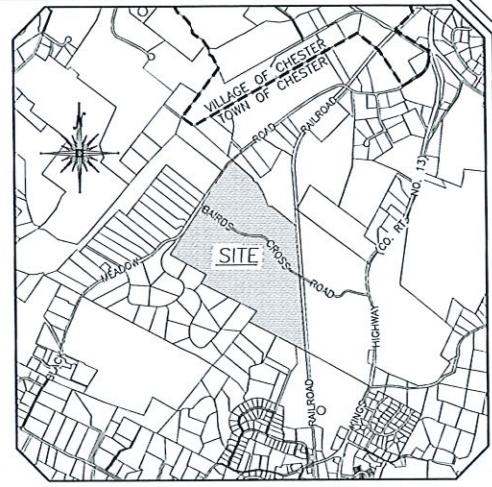
LOCATION MAP SCALE: 1"=2,000'