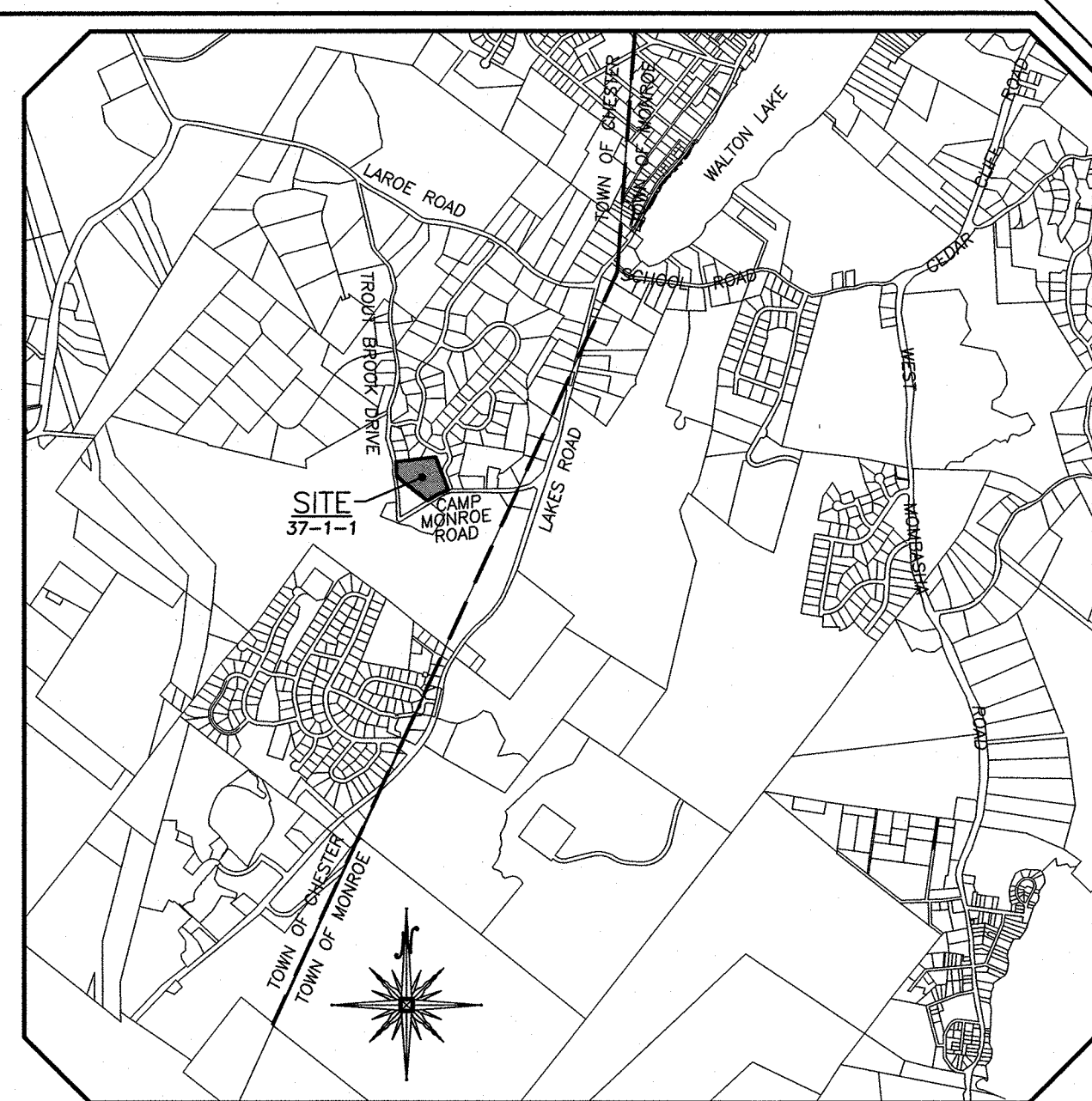
LOCATION MAP SCALE: 1"=2,000'