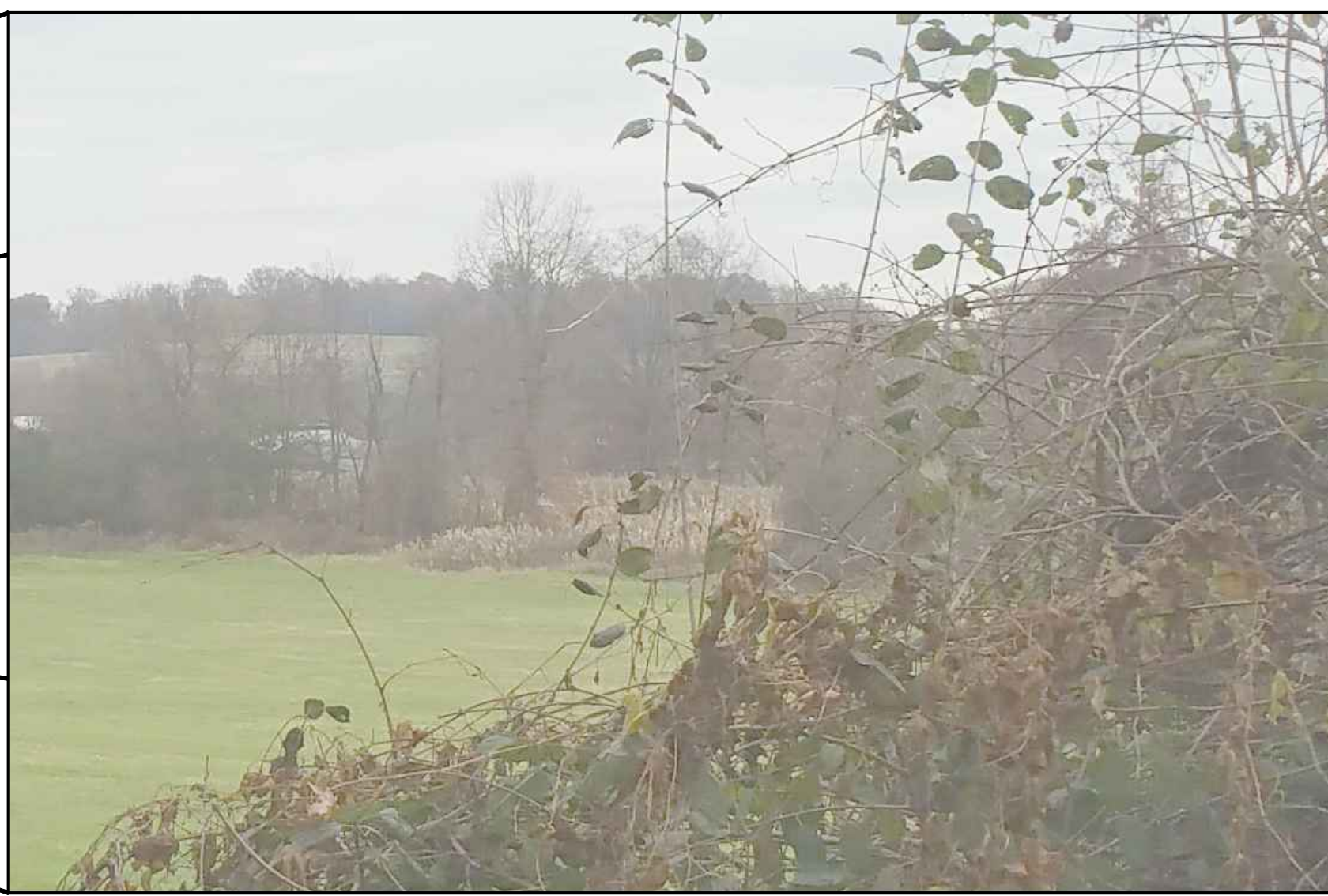
4 ENLARGED PORTION OF VIEW FROM BRIDLE LANE N.T.S.

NOTE: UPON DECOMMISSIONING OF THE SOLAR ARRAY, THE ARRAY OPERATOR SHALL REMOVE THE ARRAY, RACKING, INVERTERS, POLES, UNDERGROUND AND OVERHEAD WIRING AND ALL ASSOCIATED IMPROVEMENTS AND SHALL RETURN THE LAND TO ITS PRE-CONSTRUCTION STATE.