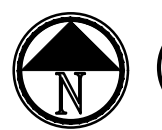
1 PREVIOUS SOLAR ARRAY LAYOUT (JAN 5, 2016 PUBLIC HEARING) 1"=150'±