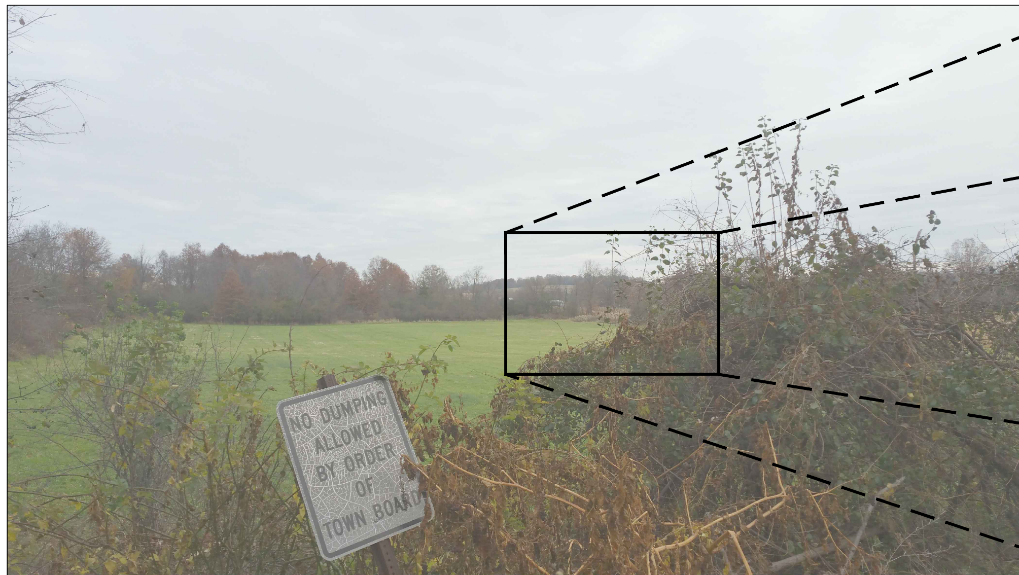
3 PHOTO VIEW FROM END OF BRIDLE LANE N.T.S.