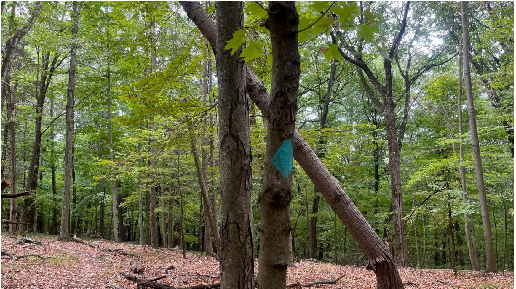
The Highlands Trail at the South end of the ridge before it drops down towards Bull Mill Road