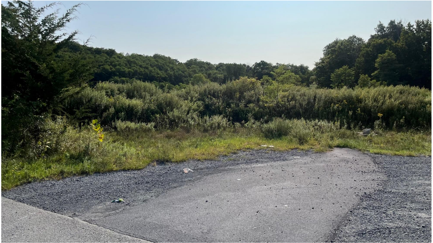
The Goosepond parking area on Bull Mill Road.