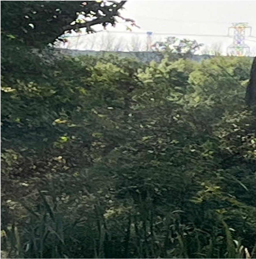
View from Lazy Hill Road approximately 200 feet down from parking lot. Electrical power tower and microwave tower visible.