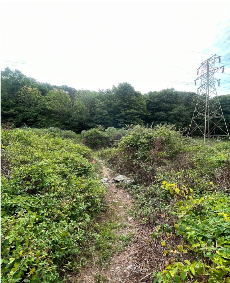
Highlands Trail at high point crossing the power lines looking south towards the direction of the proposed cell tower.