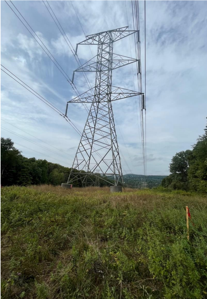
View from above the Highlands Trail taken at the high point