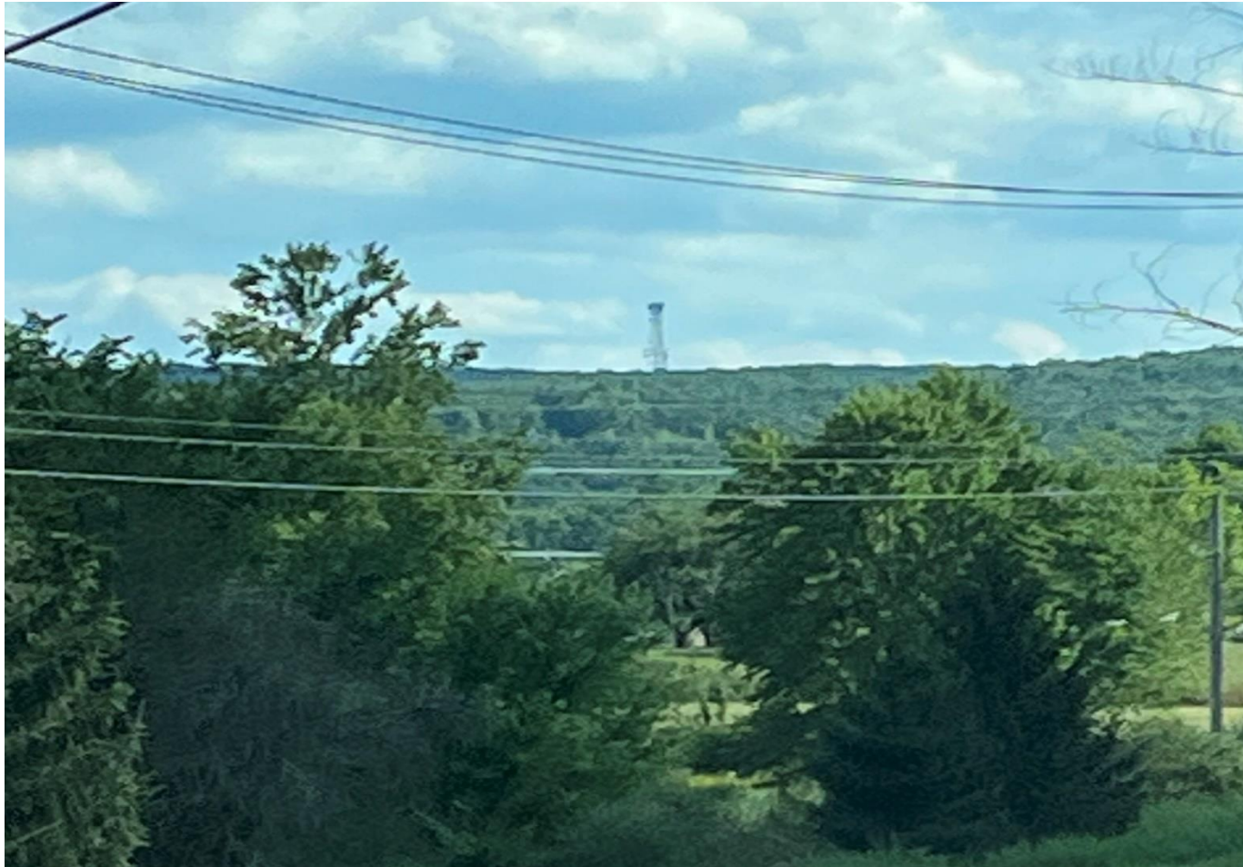
View from the Lazy Hill Road parking lot off of Laroe Road Large microwave tower visible at Neptune Drive