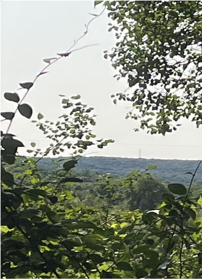
View from Lazy Hill Road approximately 300 feet down from parking lot. Neptune Drive cell tower visible.