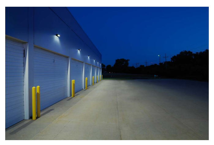
AFTER: Wallpack Full Cutoff LED luminaires provide crisp white light with excellent color rendering and uniform distribution.

BEFORE: Many HID sources like high pressure sodium or mercury vapor provide poor color rendering and non-uniform distribution.